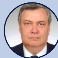
Necmettin Pamir Turkey