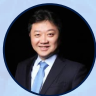
Mao Ying China