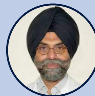
Manmohan Singh India