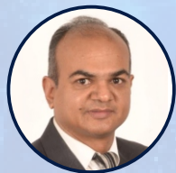
Batuk Diyora India