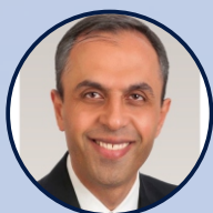
Aaron Cohen-Gadol USA