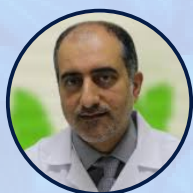
Mohamed Al-Olama UAE