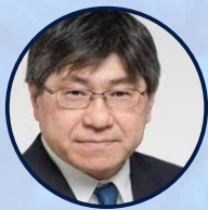
Akio Morita Japan