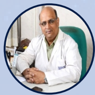
Dattatraya Muzumdar India