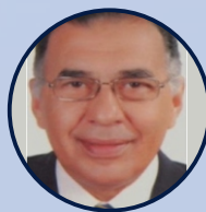
Ezzat Sheriff Egypt