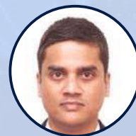
Sarat Chandra India