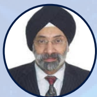
V P Singh India