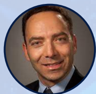
Amir Dehdashti USA