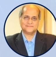
Alok Sharma India